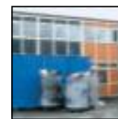
Poorly sited & secured bins