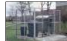
Correctly sited & secured bins